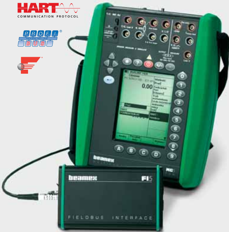
Beamex® MC5 Fieldbus Calibrator