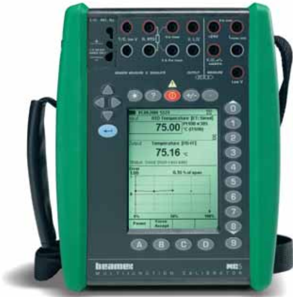
MC5 Multifunction Calibrator