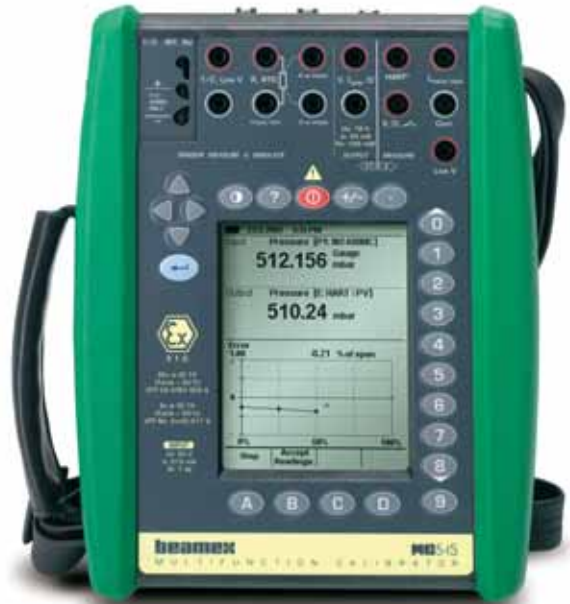
MC5-IS Intrinsically Safe Multifunction Calibrator