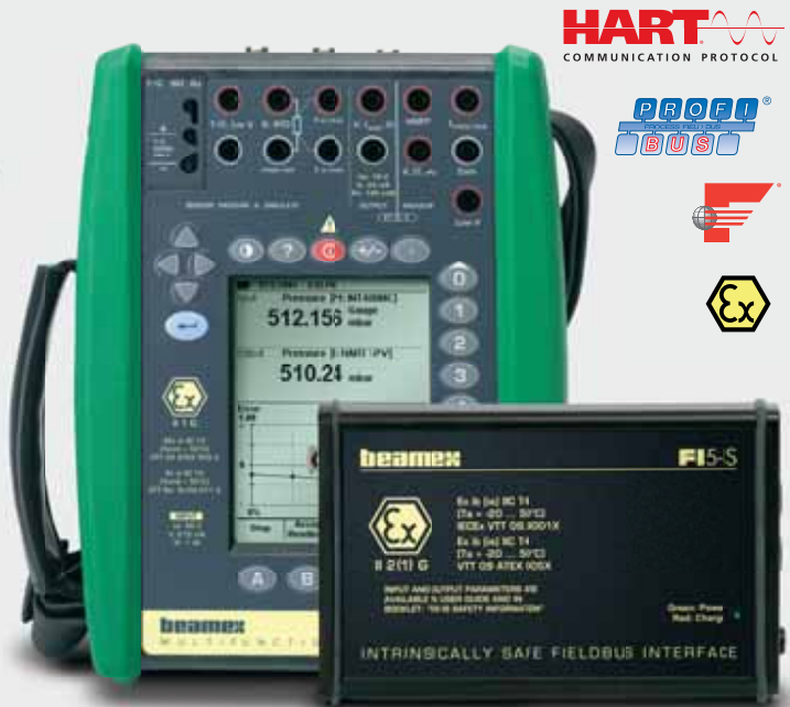
Beamex® MC5-IS Intrinsically Safe Fieldbus Calibrator